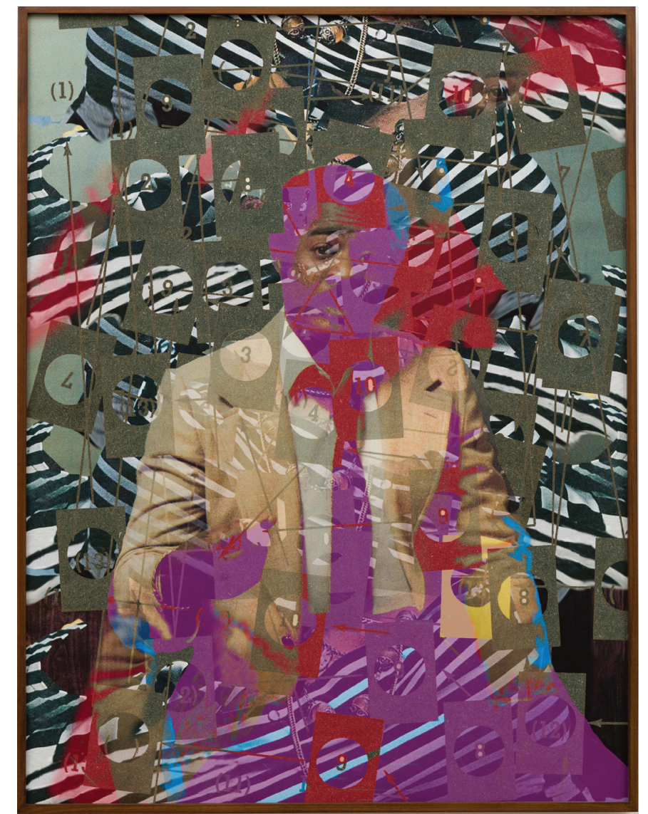
IMAGE CREDITS: top: Zero [still, detail], 2020. Single-channel video, color, and sound, 72 minutes, 25 seconds. Courtesy the artist and Anat Egbi, Los Angeles central panel: Picture for Paul Mooney ( Everybody Wants / Nobody Wants ), 2018. C-print, framed, 295. x 44.5 inches. Courtesy the artist and Anat Egbi, Los Angeles above: Figure, 2019. Inkjet print, framed; 41.25 x 31.5 inches. Courtesy the artist and Anat Egbi, Los Angeles