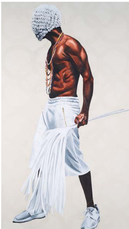
rising 2016 Acrylic on canvas 84 x 48 in.