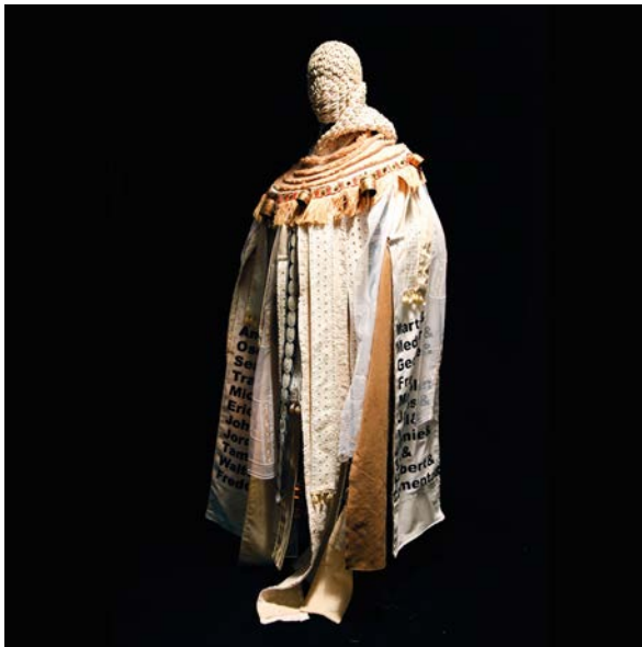
Untitled 1 2016 Archival pigment print (edition of 5) 40 x 40 in.