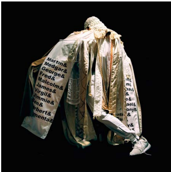
Untitled 3 2016 Archival pigment print (edition of 5) 40 x 40 in.