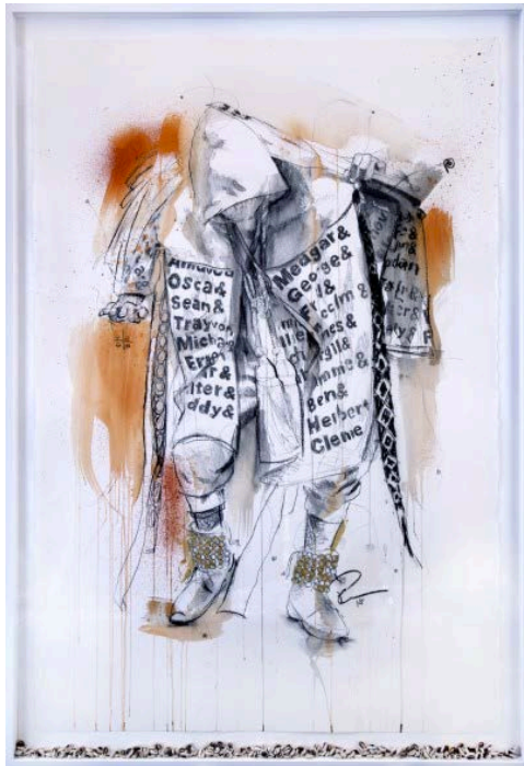
Egun Dance 1 2016 Graphite and acrylic on paper, framed with cowries 60 x 48 in. Private Collection