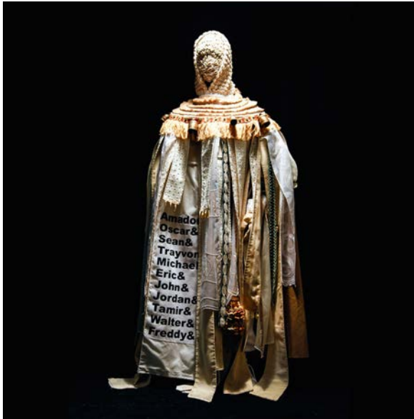
Untitled 2 2016 Archival pigment print (edition of 5) 40 x 40 in.