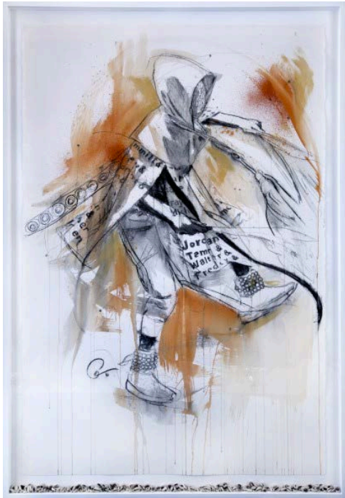
Egun Dance 3 2016 Graphite and acrylic on paper, framed with cowries 60 x 48 in.