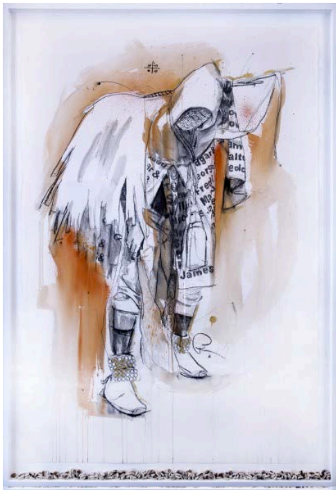
Egun Dance 4 2016 Graphite and acrylic on paper, framed with cowries 60 x 48 in.