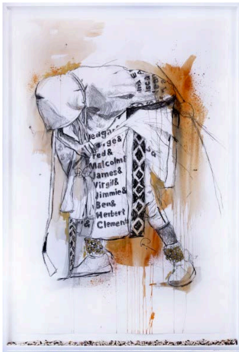
Egun Dance 2 2016 Graphite and acrylic on paper, framed with cowries 60 x 48 in. Lent by the Michael C. Carlos Museum, Emory University