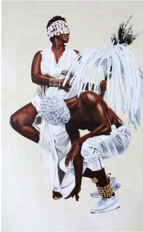
the way 2016 Acrylic and gold leaf on canvas 96 x 60 in. Private Collection