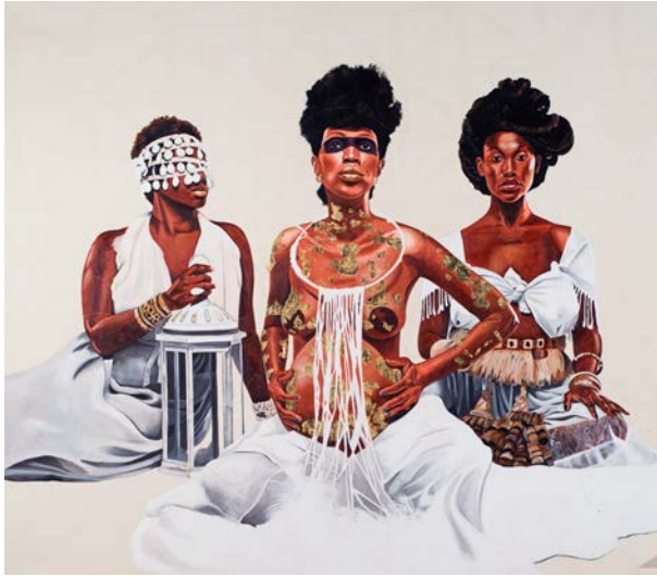
god 2016 Acrylic and gold leaf on canvas 96 x 78 in.