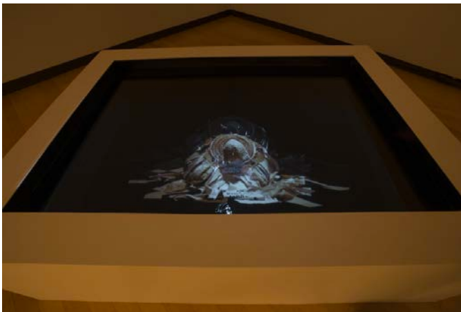
Water and Spirit 2016 Video projection on elevated water basin 49 x 64 x 20 in. Courtesy of the artist