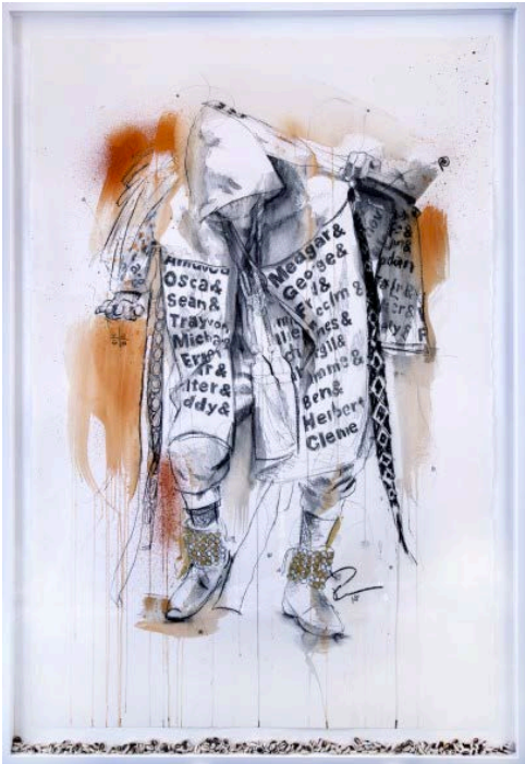
Egun Dance 5 2016 Graphite and acrylic on paper, framed with cowries 60 x 48 in.