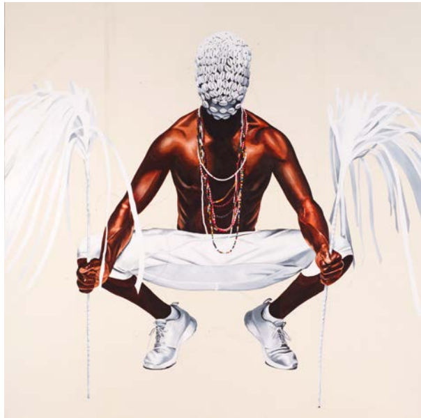
the return 2016 Acrylic on canvas 96 x 96 in.