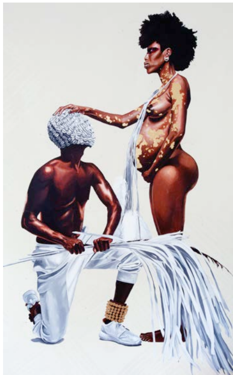
something eternal 2016 Acrylic and gold leaf on canvas 96 x 60 in.