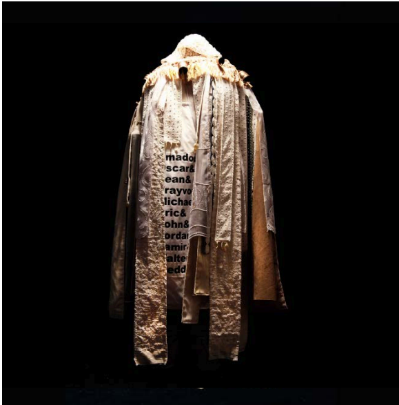
Untitled 4 2016 Archival pigment print (edition of 5) 40 x 40 in. Courtesy of the artist